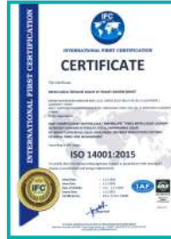
TS EN ISO 14001 : 2015 THE QUALITY MANAGEMENT