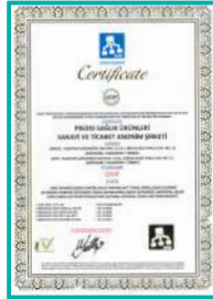
GMP GOOD MANUFACTURING PRACTICE