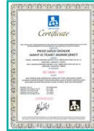
TS 18001 : 2007 OHSAS 18001 THE OCCUPATION HEALTH AND SAFETY SYSTEM