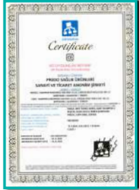
CE CERTIFICATE OF CONFORMITY