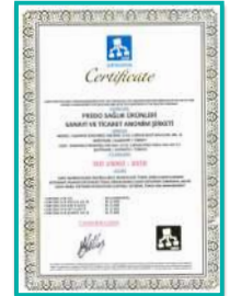
TS 10002 : 20014 THE QUALITY MANAGEMENT