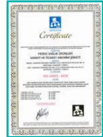
TS 10002 : 20014 THE QUALITY MANAGEMENT