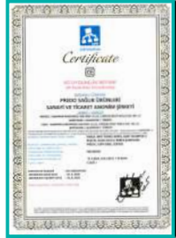
CE CERTIFICATE OF CONFORMITY