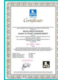
TS 18001 : 2007 OHSAS 18001 THE OCCUPATION HEALTH AND SAFETY SYSTEM