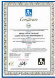
GMP GOOD MANUFACTURING PRACTICE