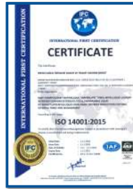
TS EN ISO 14001 : 2015 THE QUALITY MANAGEMENT