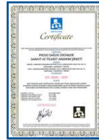
TS 18001 : 2007 OHSAS 18001 THE OCCUPATION HEALTH AND SAFETY SYSTEM