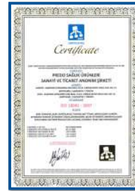
TS 18001 : 2007 OHSAS 18001 THE OCCUPATION HEALTH AND SAFETY SYSTEM