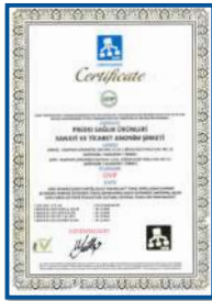
GMP GOOD MANUFACTURING PRACTICE