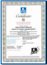
CE CERTIFICATE OF CONFORMITY