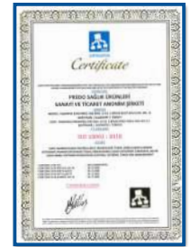
TS 10002 : 2004 THE QUALITY MANAGEMENT