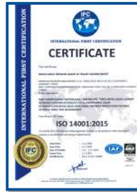
TS EN ISO 14001 : 2015 THE QUALITY MANAGEMENT