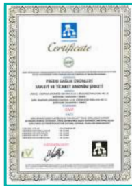
GMP GOOD MANUFACTURING PRACTICE