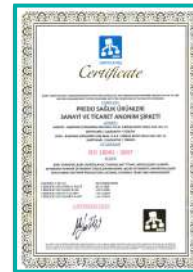
TS 18001 : 2007 OHSAS 18001 THE OCCUPATION HEALTH AND SAFETY SYSTEM