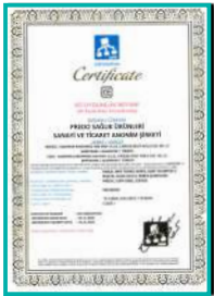
CE CERTIFICATE OF CONFORMITY