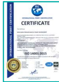
TS EN ISO 14001 : 2015 THE QUALITY MANAGEMENT