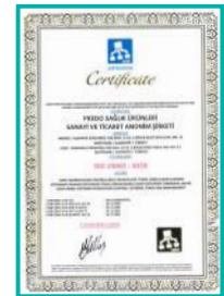
TS 10002 : 2004 THE QUALITY MANAGEMENT