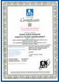
CE CERTIFICATE OF CONFORMITY