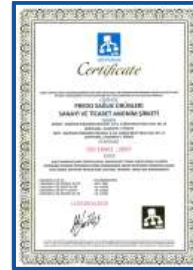
TS 18001 : 2007 OHSAS 18001 THE OCCUPATION HEALTH AND SAFETY SYSTEM