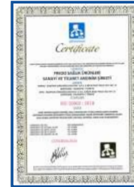
TS 10002 : 20014 THE QUALITY MANAGEMENT