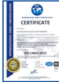
TS EN ISO 14001 : 2015 THE QUALITY MANAGEMENT