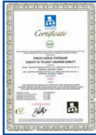
GMP GOOD MANUFACTURING PRACTICE